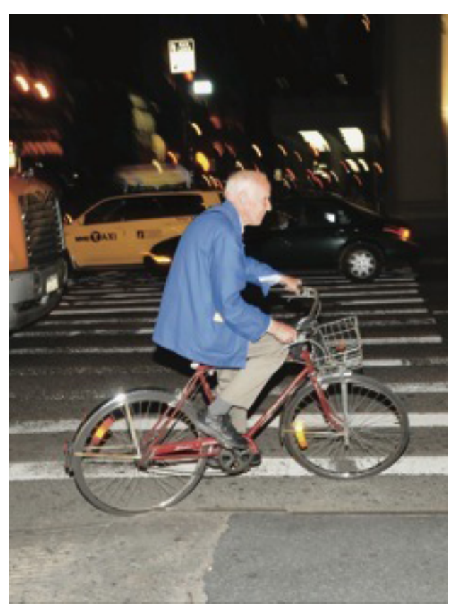
Bill Cunningham: "I'm looking for something that has beauty."

"On the Street"—along with Cunningham's society column, "Evening Hours"—is New York's high-school yearbook, an exuberant, sometimes retroactively embarrassing chronicle of the way we looked. Class of 1992: velvet neck ribbons, leopard prints, black jeans, catsuits, knotted shirts, tote bags, berets (will they ever come back, after Monica?). Class of 2000: clamdiggers, beaded fringe, postcard prints, jean jackets, fish-net stockings, flower brooches (this was the height of "Sex and the City"). The column, in its way, is as much a portrait of New York at a given moment in time as any sociological tract or census—a snapshot of the city. On September 16, 2001, Cunningham ran a collage of signs ("OUR FINEST HOUR," "WE ARE STRONGER NOW") and flags (on bandannas, on buildings, on bikes) that makes one as sad and proud, looking at it now, as it did when it was pub-